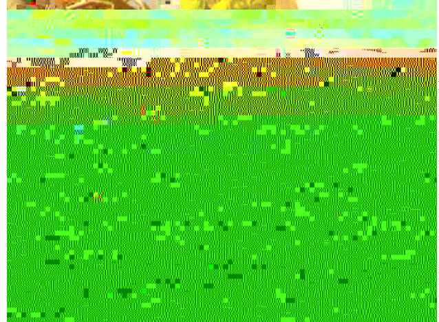
First spotted at Rio Bosque in 2010, bobcats, including this one, are now well established at the park. Photo: Blanca Ramirez, June 9, 2013.

The park's 2 new windmills are performing well. Thanks to water from one, a stand of Goodding